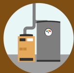
Furnaces and Hot Water Heaters