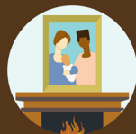
Family Photographs or Keepsakes