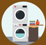
Clothing Washers and Dryers

Basement items are covered under Contents Coverage if they are connected to a power source. Examples include: