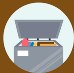
Freezers and Contents