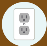
Electrical Outlets and Light Switches