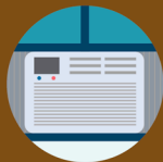
Window Air Conditioners